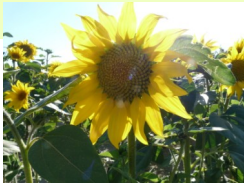
Sunflowers grow locally during July and August.

Aubeterre is only a 15 min walk, said to be one of the prettiest villages in France. Aubeterre has a butcher, baker, bank, museums, underground church and lots of interesting gift shops.